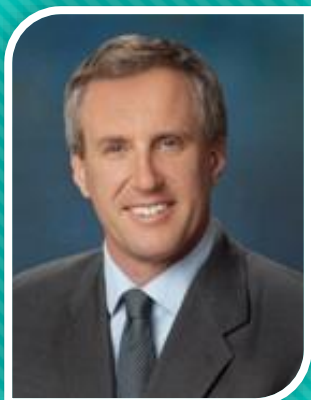
Commissioner David Hochschild California Energy Commission