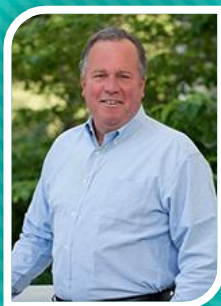
Senator Bill Dodd