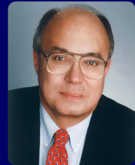
Senator Joe Simitian Chair, Senate Environmental Quality Committee